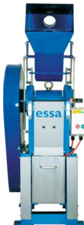
JC2000 with Auto Lift Infeed Hopper

Due to the sturdy design, ESSA Jaw Crushers are virtually maintenance free.