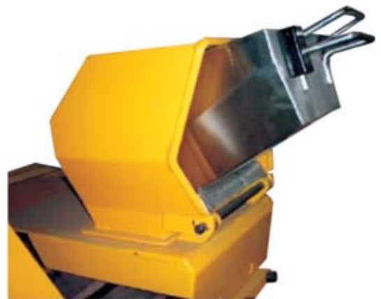
JC2500 with self feeding safety Hopper that provides adjustable feed rate