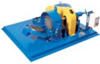
Disc Mill Pulverizer