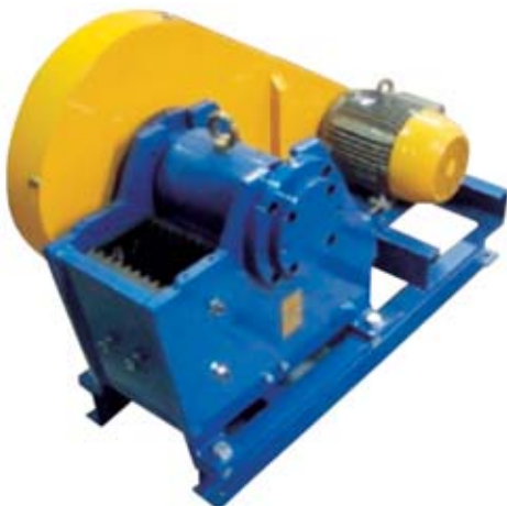
JC2000 Integration version

Essa Jaw Crushers are available as well to be integrated in a sample tower. This Crusher are designed to operate continuously for on line crushing operations in a sample tower. The integration crushers are supplied without the In feed Hopper and without the Motor Protections Switch. The Motor of the Crusher will be supplied according to the customer's requirements.