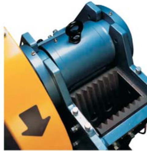
JC 2000 serrated Jaw Plates

All Wear Parts can be replaced easily or the Jaw Crusher can be ordered to be delivered with the desired Jaw Plates and Side Liners.