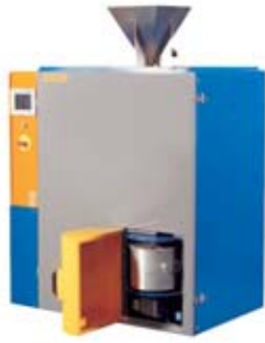
Auto Batch Mill