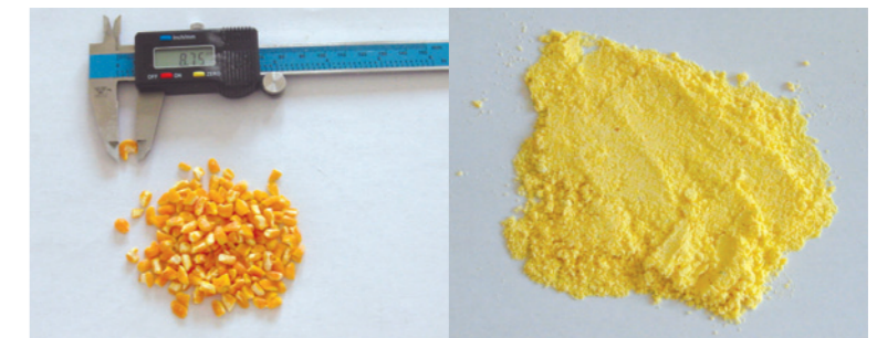
Different food stuff such as maize, grain etc.