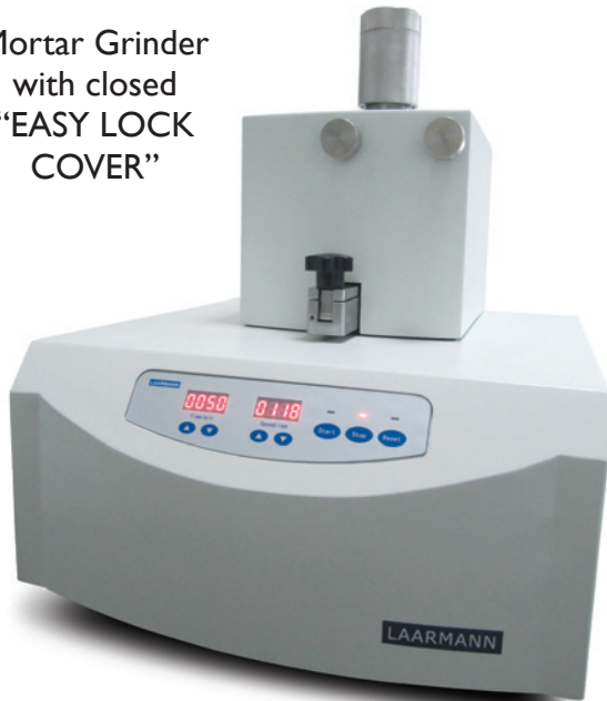
Mortar Grinder with closed “EASY LOCK COVER”